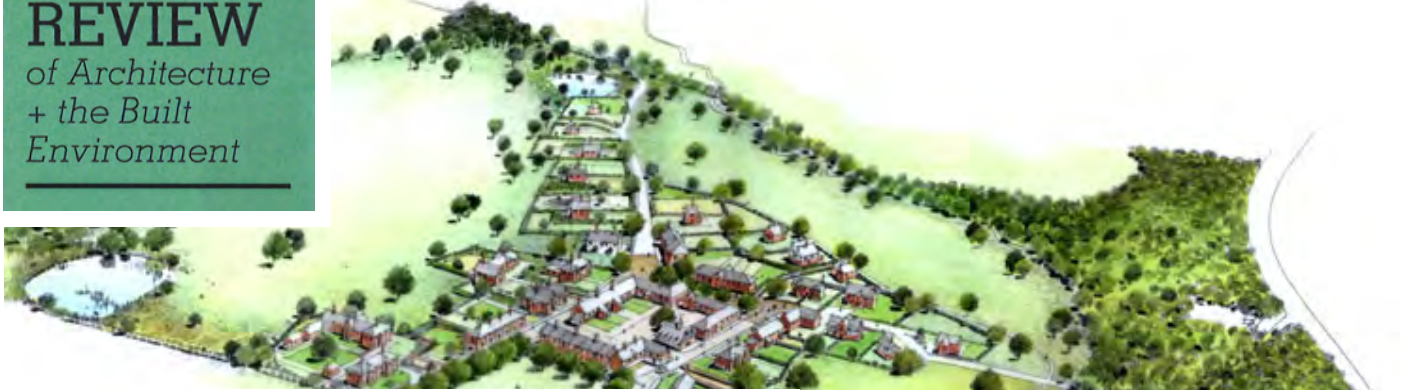
New Settlements in the Countryside

March 2014 has seen the publication of the Government sponsored Farrell Review of Architecture and the Built Environment. When the Review was launched Ed Vaizey MP, Minister for Culture, Communications and Creative Industries in the DCMS said “Good design builds communities, creates quality of Life and makes places better for people to live, work and play in. I want to make sure we are doing all we can to recognise the importance of architecture and reap the benefit of good design” . www.farrellreview.co.uk