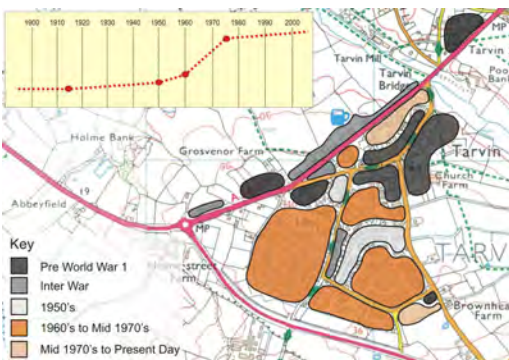
Settlement Character Appraisals